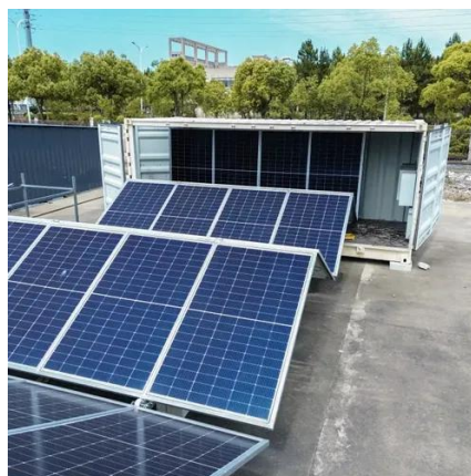
Containerized energy storage , Microgreen.ca

Range of MWh: we offer 20, 30 and 40-foot container sizes to provide an energy capacity range of 1.0 - 2.9 MWh per container to meet all levels of energy storage demands.